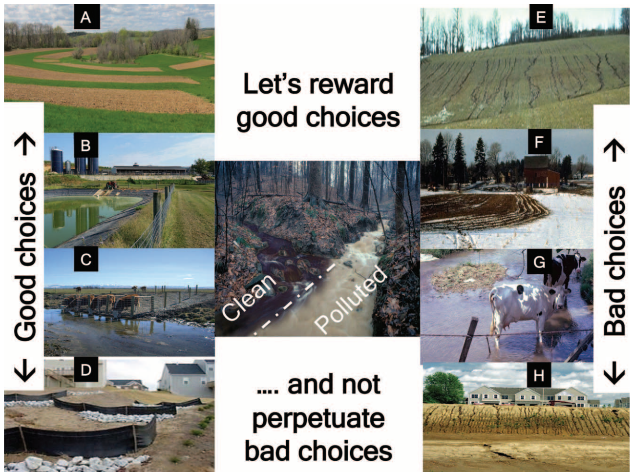
Figure 3. Good land use choices like grass waterways, terracing, and contour planting (photograph by BWS) (A), manure storage lagoons (photograph by D. Arscott, Stroud Water Research Center) (B), cattle-watering structures (photograph by A. Sigler, Montana State University) (C); and sediment erosion controls (photograph courtesy Natural Resources Conservation Service [NRCS]) (D) result in clean water in nearby streams (center; left tributary). Poor land use choices, such as farming up and down steep slopes (photo BWS) (E), spreading manure on frozen fields (photograph by R. Vannote, Stroud Water Research Center) (F), allowing cattle to access streams (photograph by BWS) (G), and improper erosion controls on construction sites (photograph by L. Betts, NRCS) (H) result in highly turbid, polluted water in nearby streams (center; right tributary). Center photograph by D. Funk, Stroud Water Research Center.

tive plan for BMPs, on the other hand, provide additional incentives for the landowner to come to the table, which would help reduce in-house and inter-institutional conflicts that currently result in eased land with inadequate water conservation measures.