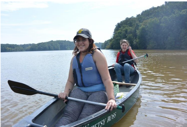
As we grow in our programming, we explore new opportunities to bridge students together with their local watersheds such as these high school students on Octoraro Reservoir.