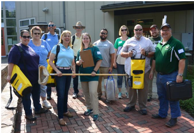
2018 was a big year for teacher professional development workshops with new partners and in new areas of the United States!