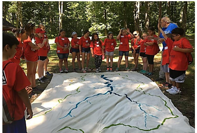
Summers continue to 'flow' with over nine different camps from Scouts to on-the-water river treks.

The education department was recognized as the Outstanding Environmental Education Program by the Pennsylvania Association of Environmental Educators in 2015. The WikiWatershed toolkit was awarded the 2017 Governor's Award for Excellence by the Pennsylvania Department of Environmental Protection.