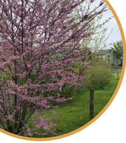
Many small trees and shrubs have beautiful blooms, like this redbud.